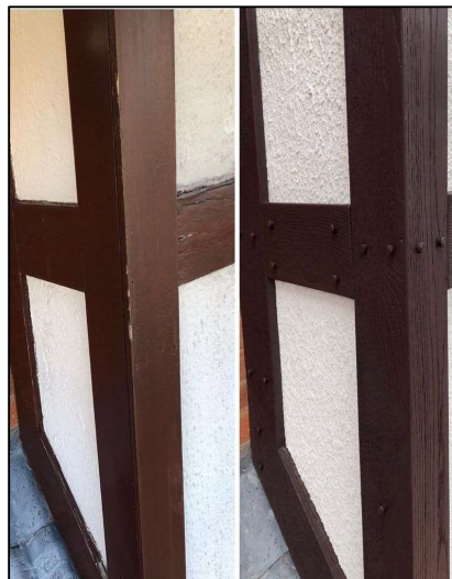
Before & after with brown boards