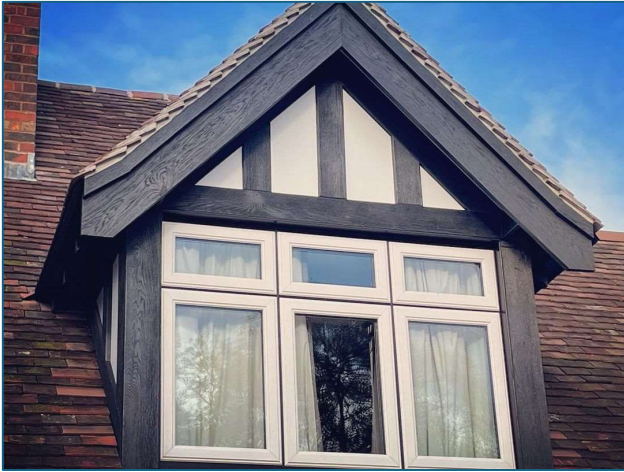
Black boards used as timbers and bargeboard