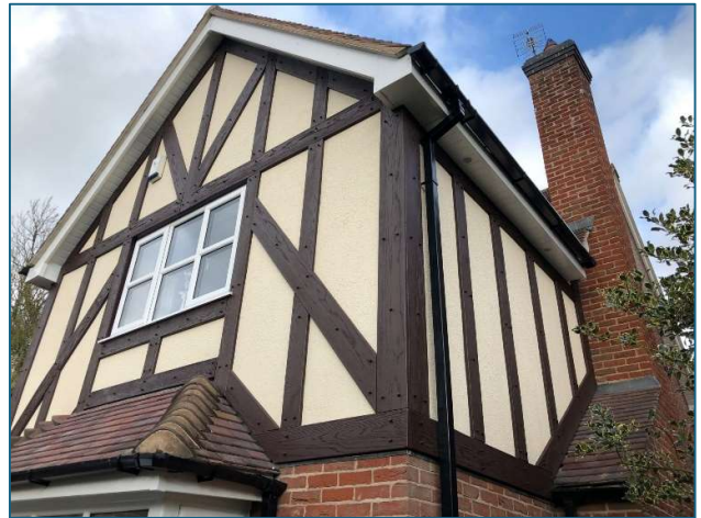
Brown boards used to blend in with house colour