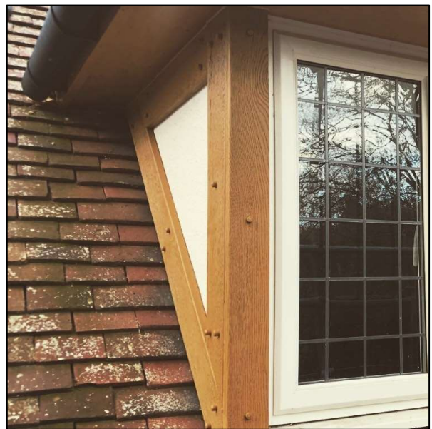
Golden Oak used in this picture.