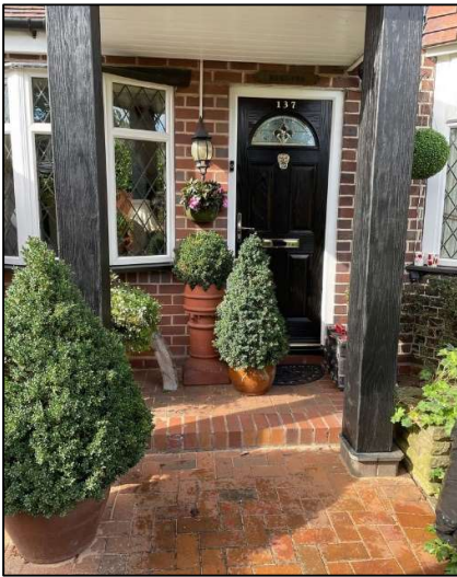
Black boards used as Post Covers