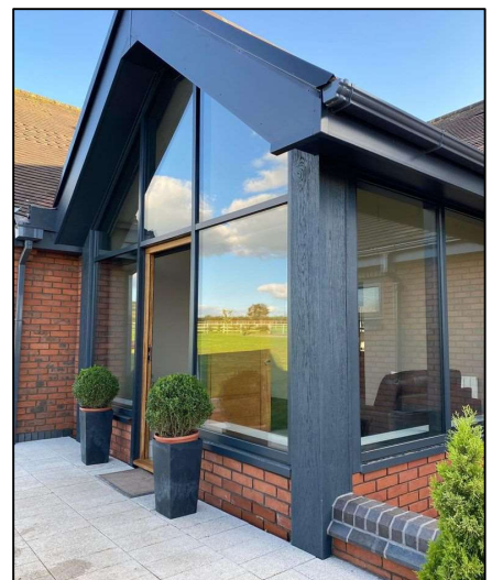
Anthracite 7016 in this picture